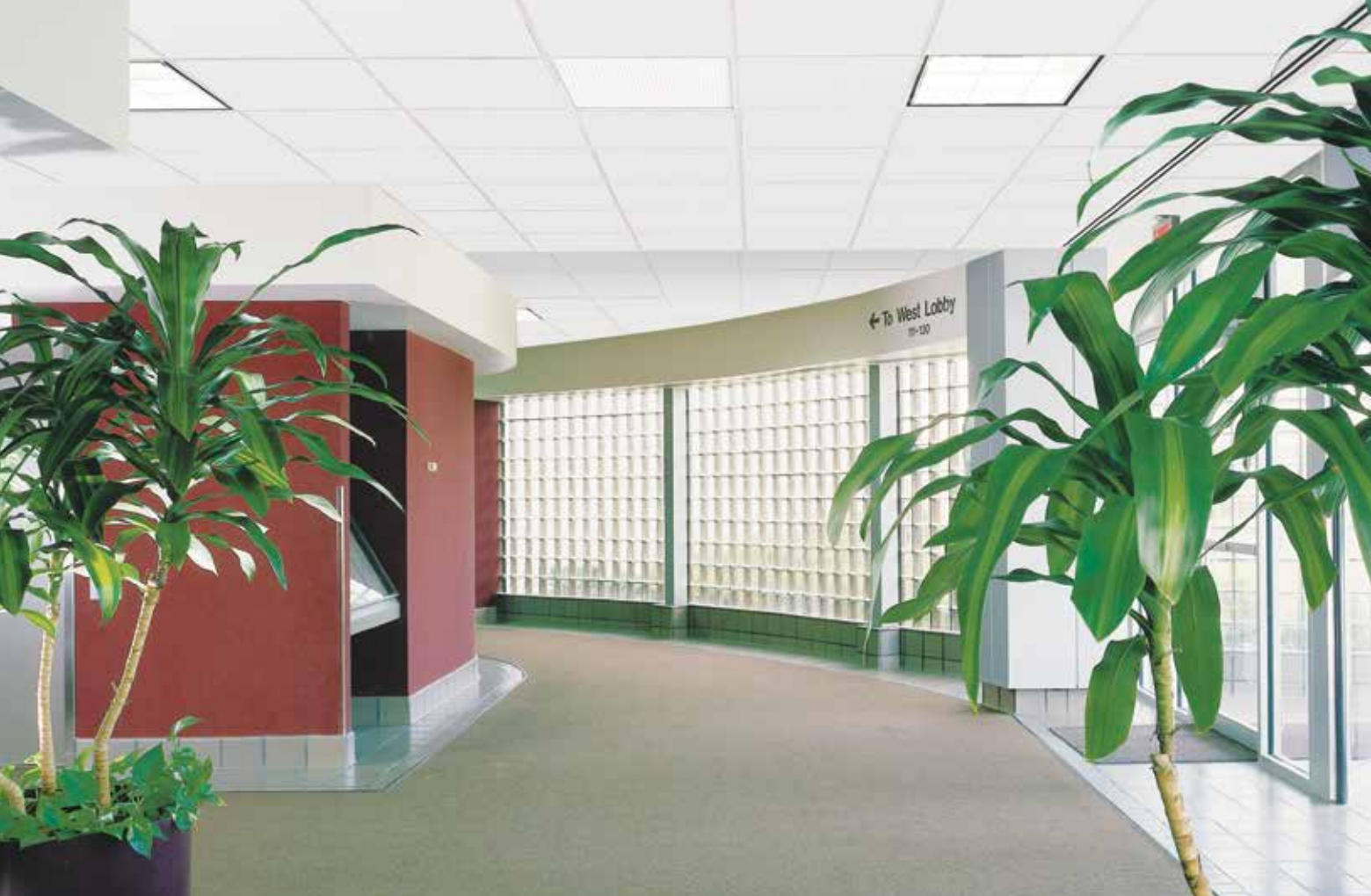
Sand Micro™ Reveal (SHM-154)