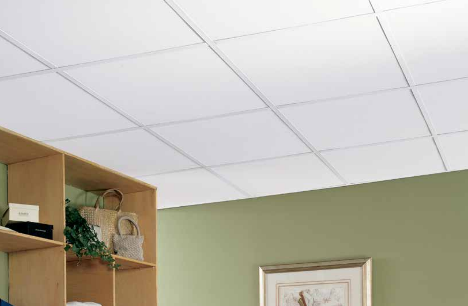
Symphony® g IOF Trim (1112-IOF-1)